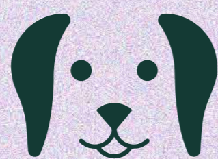
Dog Sitter (for friends)